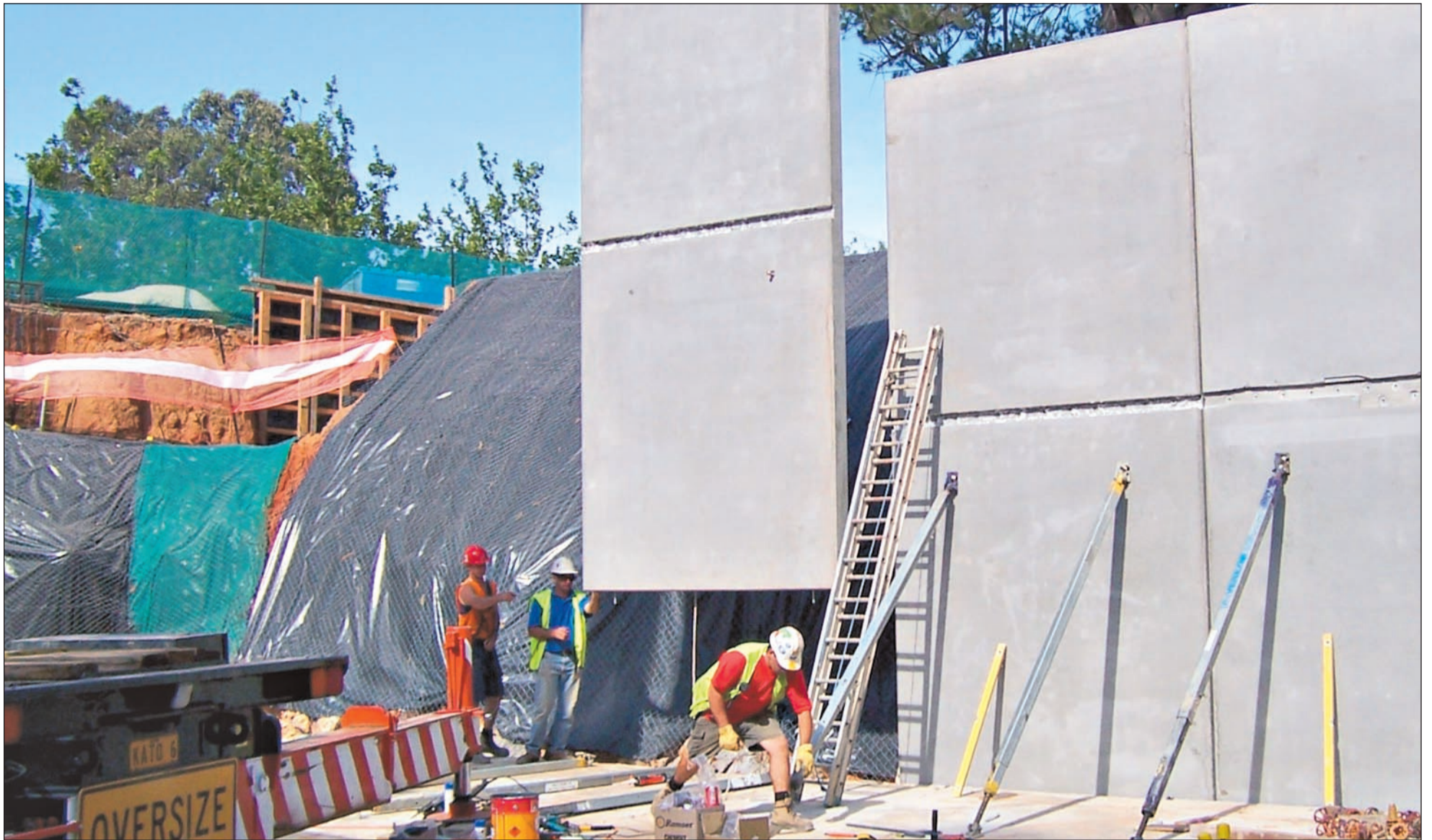
Installation of the precast concrete basement retaining walls. The heaviest panels weighed in excess of nine tonnes